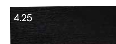
4.25 Medium Coffee Brown