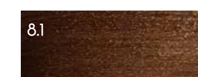
8.1 Light Ash Blonde