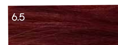
6.5 Vibrant Red