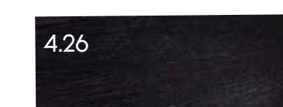
4.26 Violet Blue