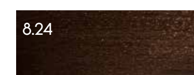
8.24 Milk Chocolate