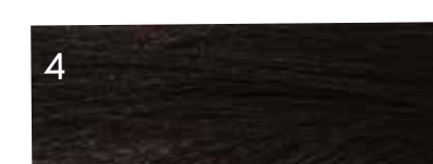
4 Medium Brown