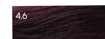
4.6 Deep Violet