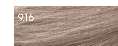
9.16 Pearl Blonde