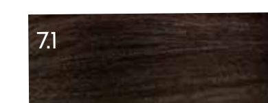
7.1 Medium Ash Blonde