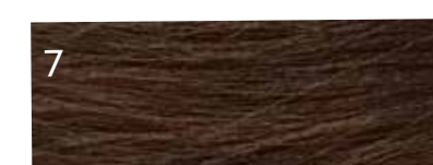
7 Medium Blonde