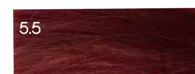
5.5 Fiery Red