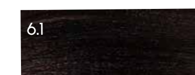
6.1 Dark Ash Blonde