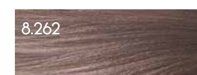
8.262 Light Blonde Cool Beige