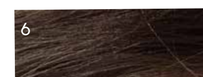
6 Dark Blonde