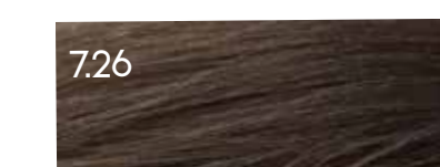
7.26 Cool Medium Blonde