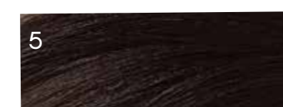
5 Light Brown