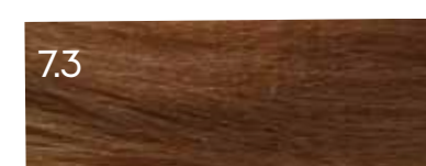
7.3 Medium Golden Blonde