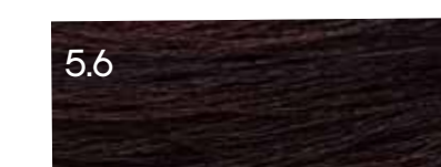
5.6 Intense Violet