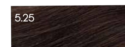
5.25 Light Coffee Brown