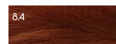
8.4 Light Copper Blonde