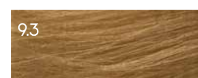
9.3 Very Light Golden Blonde