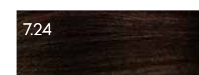
7.24 Medium Chocolate